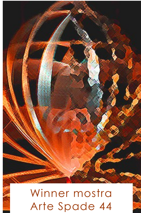
Winner mostra Arte Spade 44